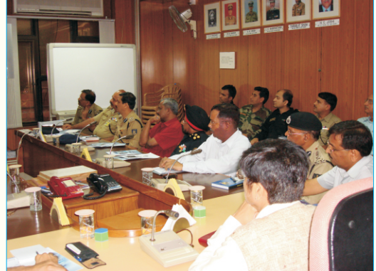
Workshop held on Trends in

The workshop was conducted by the experts in electronics and communication from M/S Sony company and Delhi Police. The Workshop aimed at finding Software solutions to surveillance problems faced by various Police forces Video Surveillance at BPRD office in their sphere of work.